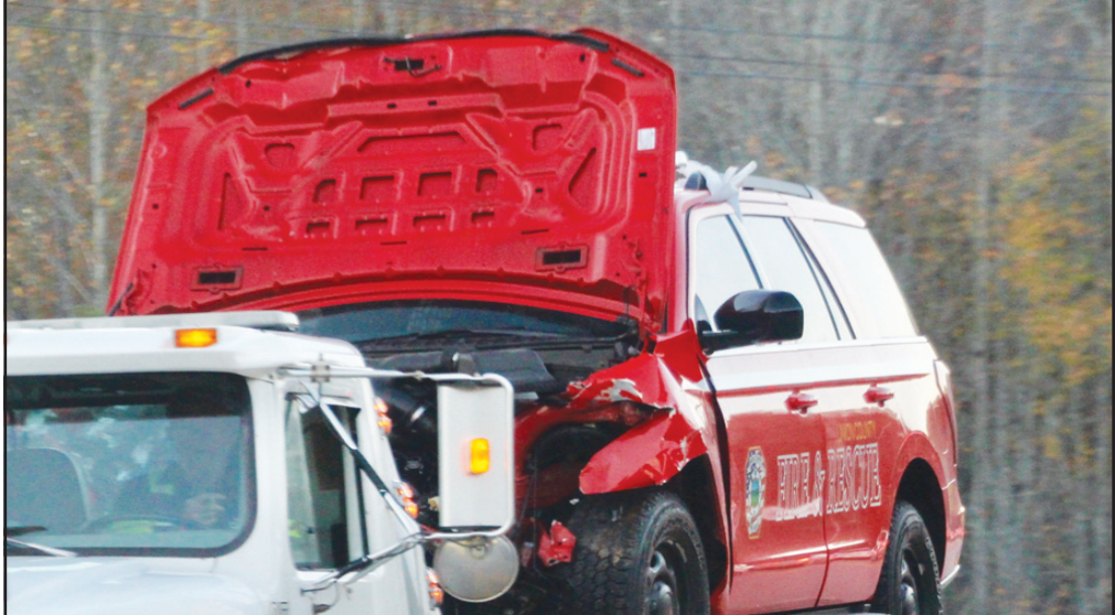
The Union County Fire Department's 2018 Ford Expedition was totaled in the Nov. 1 crash.